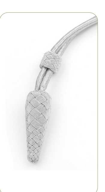
Silver Dress Knot