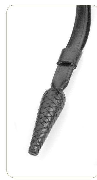
Black Leather Knot