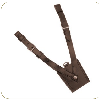
Sam browne frog in brown or black leather