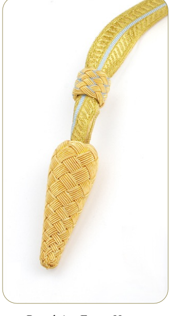
Royal Air Force Knot