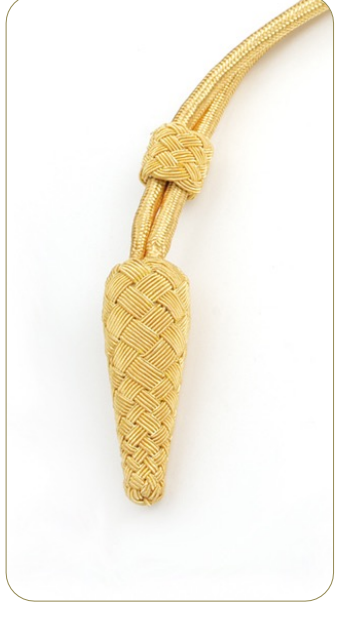
Golden Dress Knot