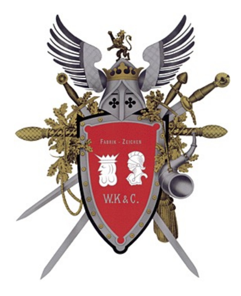
British Military Swords and Scabbards

W.K.C. Stahl- und Metallwarenfabrik Hans Kolping GmbH & Co. KG Wittkullerstr. 140-144 - 42719 Solingen - Germany www.wkc-solingen.de