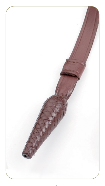
Brown Leather Knot