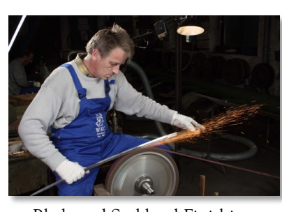
Blade and Scabbard Finishing