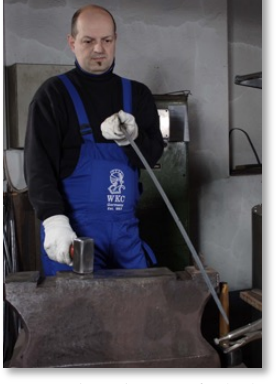
Setting the Shape of Blade