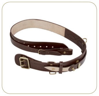
Sam browne belt with strap in brown or black leather

All belts and frogs are produced according to the MOD specifications.