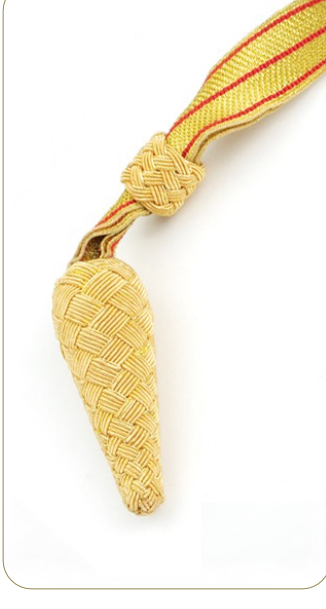
Gold & Crimson Knot